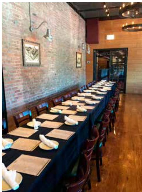
The Karl Strauss Room at Goose Island Brewpub.