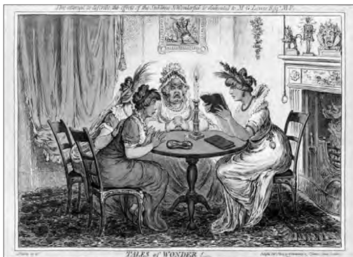
Tales of Wonder!