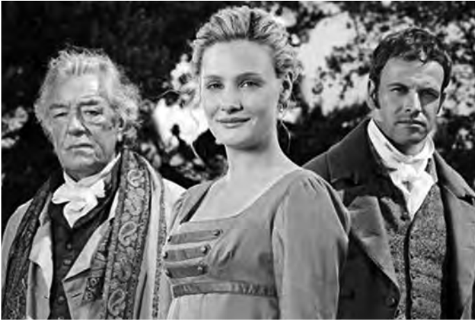
Left to right: Mr. Woodhouse (Sir Michael Gambon); Emma (Romola Garai); Mr. Knightley (Jonny Lee Miller).

woman, which she should be. Louise Dylan's Harriet Smith is perfect, with just the right amount of silliness and gullibility, a willing foil for Emma, but with a little more sensitivity than is often displayed. Tamsin Greig does a fine job as Miss Bates, less annoying than usual, probably because she does not prattle on as is usually the case with actresses in this part. Some reviewers found this a fault of the director and screenwriter, and it well may be, but for the viewer, it was probably a welcome relief. She is in the novel to show us the state of unmarried women in Jane Austen's day; perhaps making her so ridiculous often lets us lose sight of that fact.