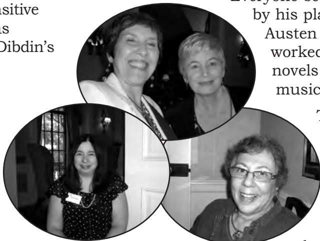
GCR Members enjoying tea.

The afternoon concluded with a sumptuous tea, allowing attendees to dispose of themselves throughout the elegant interiors of the Club. How Eliza Austen—and, we hope, Jane as well—would have loved it!